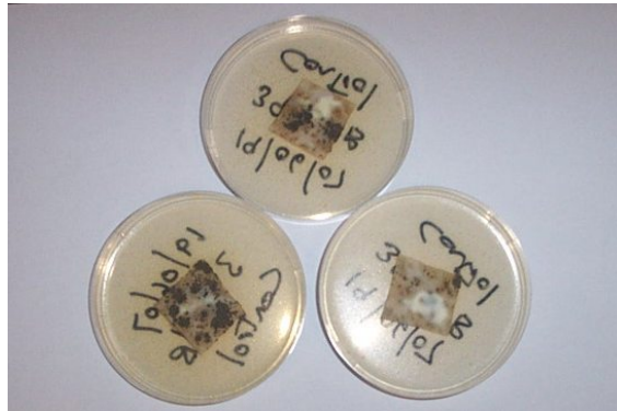
Filter paper controls after 14 days incubation

Result: After fourteen days, each piece of filter paper supported profuse mould growth, confirming that the test fungi were viable and that the conditions within the test chamber were suitable for mould growth.